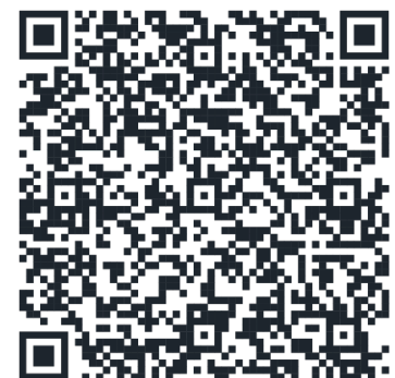
Scan to view the Community Planning Portal. Turn off desktop site view if viewing on mobile.